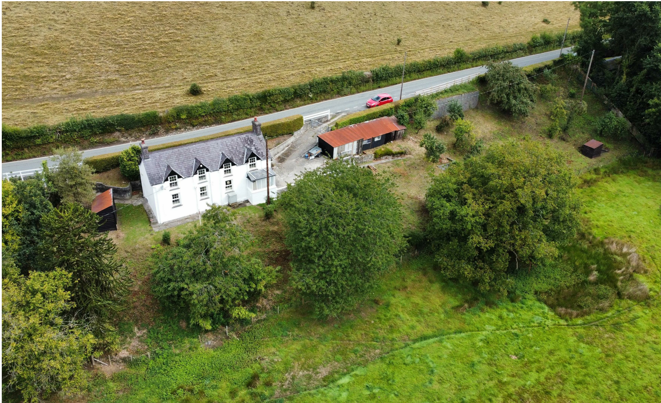
Royal Oak , Llanafan Aberystwyth Ceredigion SY23 4AX Guide price £245,000