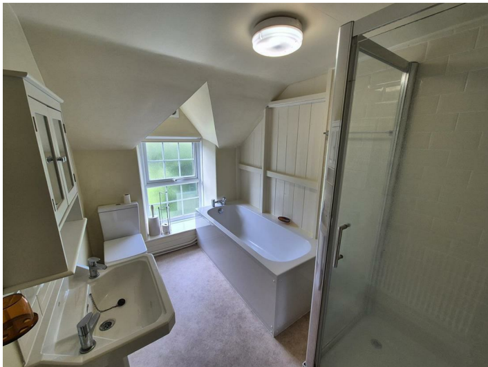
Comprising of LLF WC, Large shower cubicle, wash handbasin, radiator. Obscured window to fore.