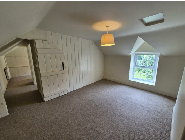
Window to fore and radiator.