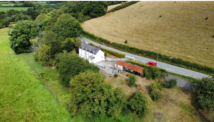
Restricted vehicular access (possible to widen) to vehicular hardstanding. Garage and attached storage sheds 30 x 8 Max Garden shed Free standing oil-fired central heating boiler. Large orchard well stocked with fruit trees.