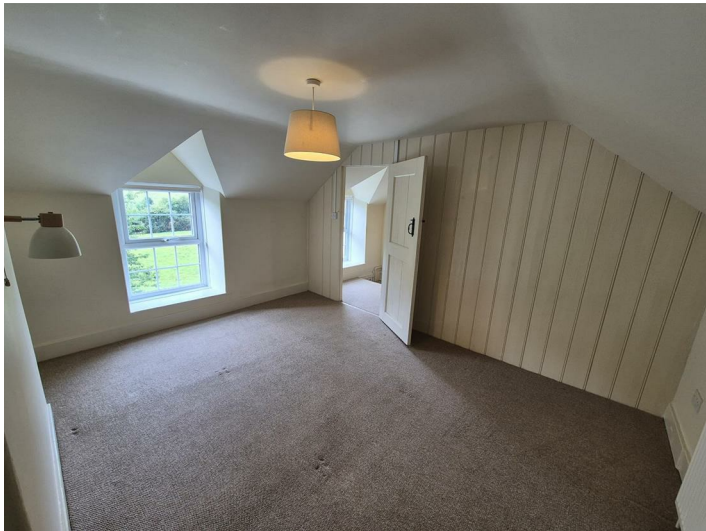
Window to fore, radiator.