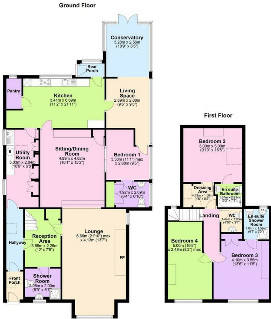
The Floor plans are for guidance only. Plan produced using PlanUp. Elton, Borth