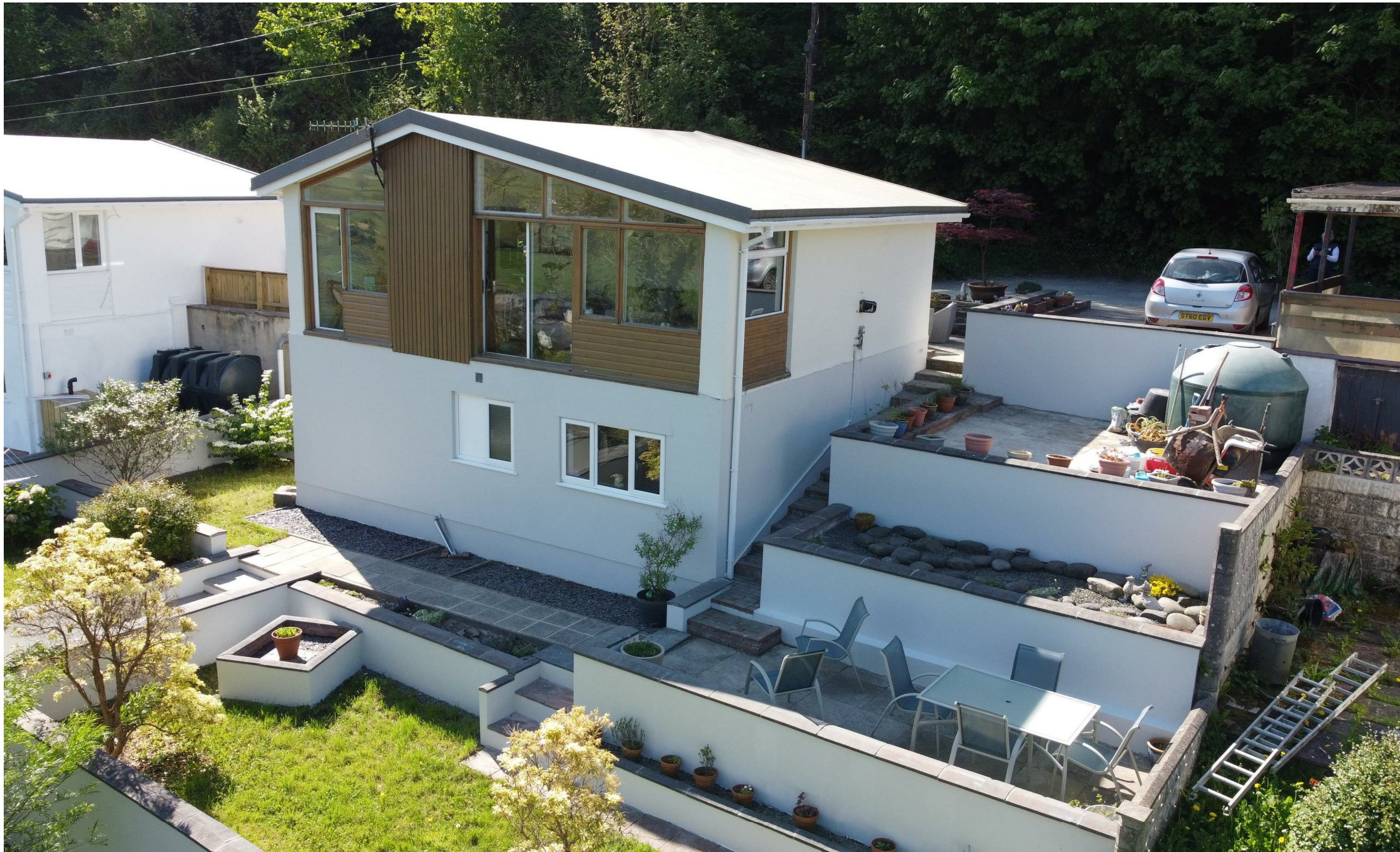
3 Hillside, Clarach Aberystwyth Ceredigion SY23 3DQ Guide price £235,000