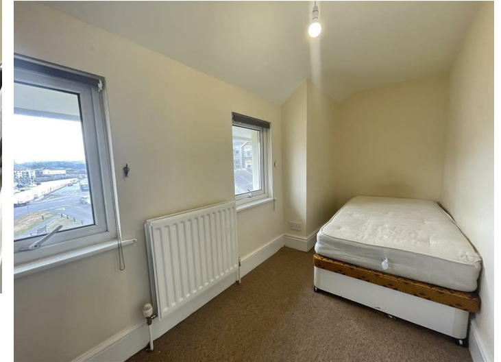
With window to fore and radiator.