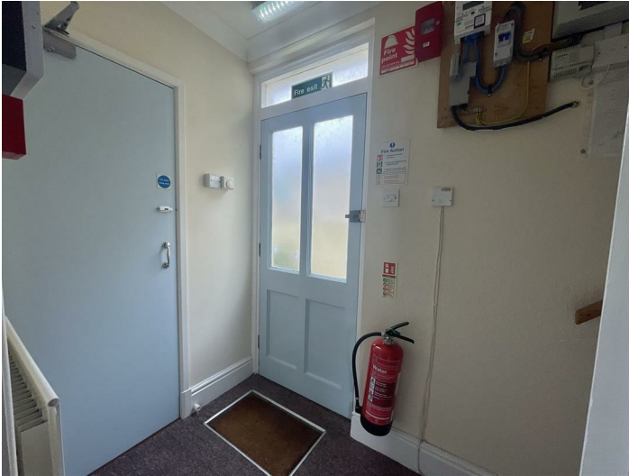
Stairs to first floor accommodation and door to