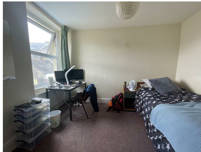
With radiator and window to fore.