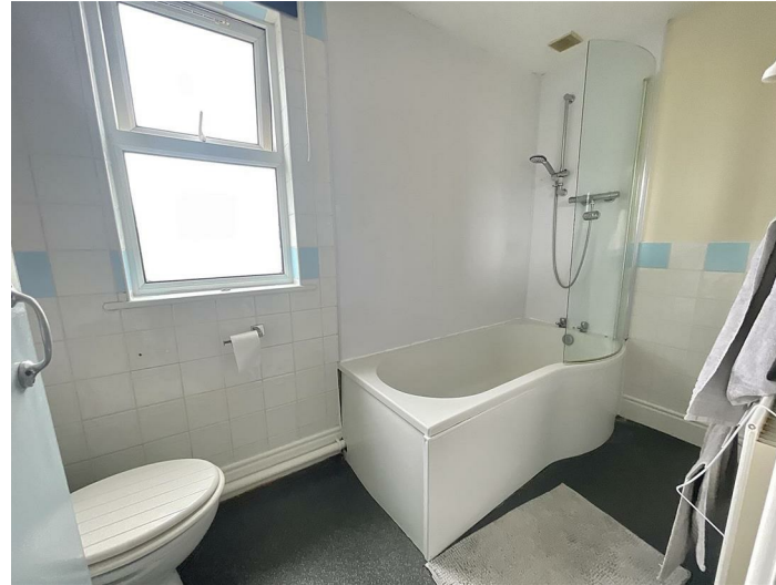
Comprising wc, panelled P shaped bath with shower and screen over. Obscured window and tiled splashback.