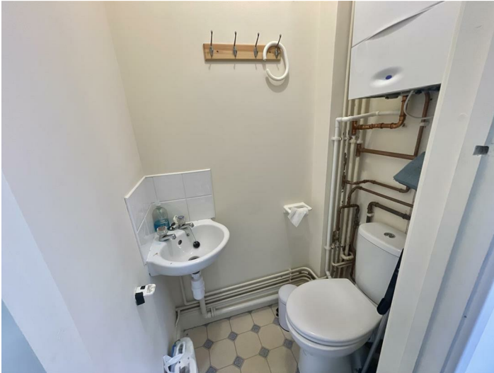
With wc, wash hand basin and housing the Gas Fired Central Heating combi boiler.