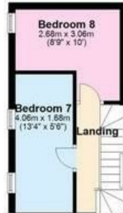
Colenso. 11A Rheidol Terrace, Aberystwyth