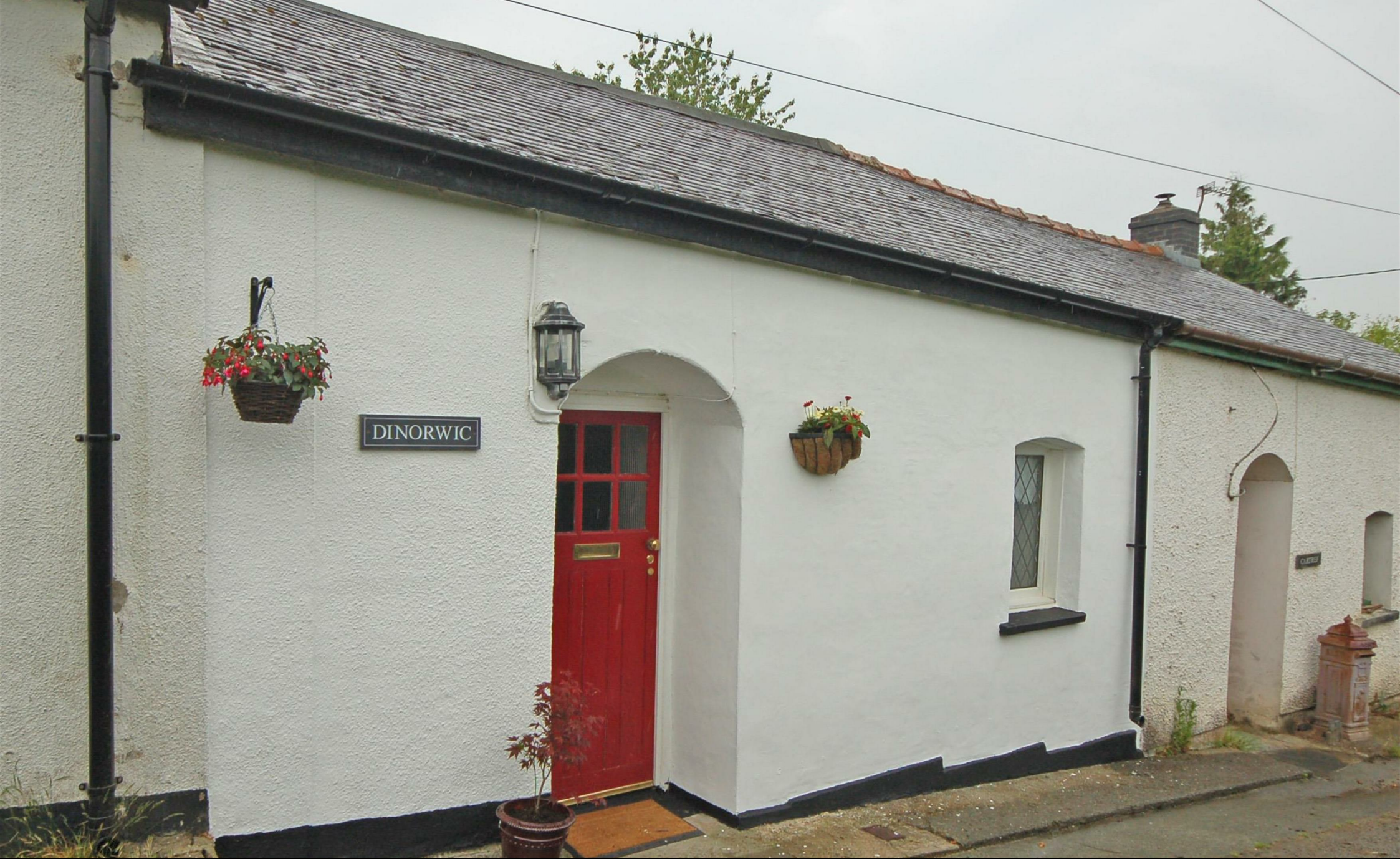
Dinorwic , Cnwch Coch Aberystwyth Ceredigion SY23 4LQ Guide price £105,000