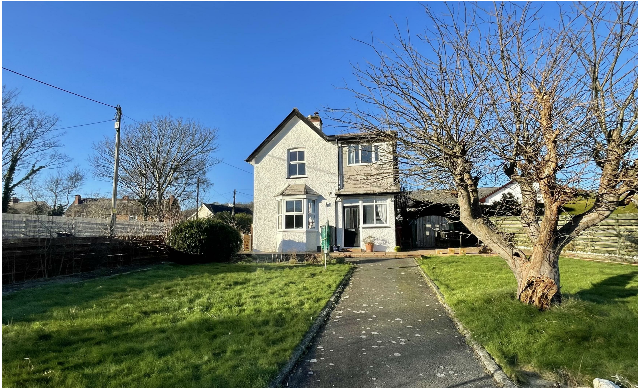
Morawel , Clarach Aberystwyth SY23 3DP Guide price £350,000