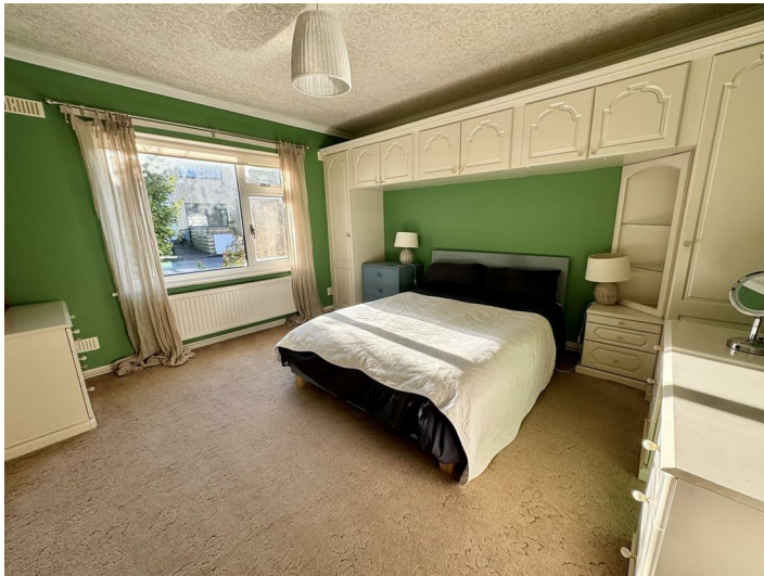
With window to side, fitted bedroom furniture and mirrored wardrobes and radiator.