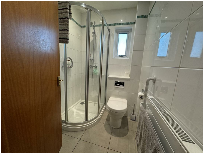
With low level flush wall mounted wc, wash hand basin, led it mirror/vanity cupboard, corner shower cubicle with mains fed shower, obscured window to rear. Tiled flooring and tiled walls.