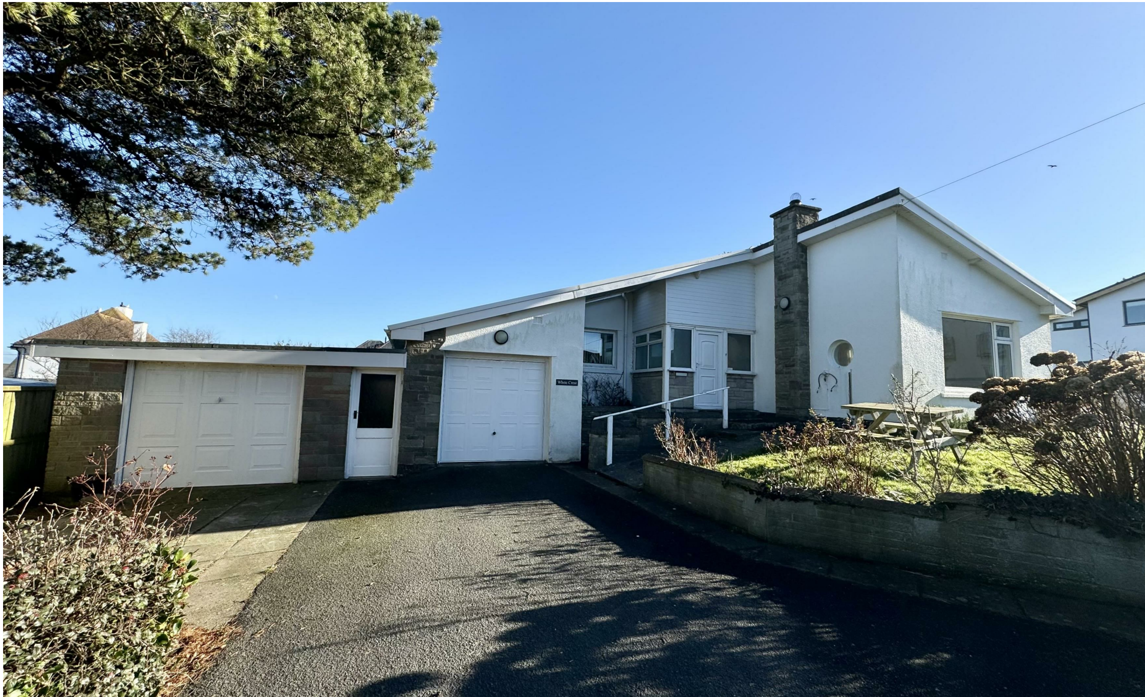
White Crest Cliff Drive, Borth Aberystwyth Ceredigion SY24 5NL Guide price £365,000