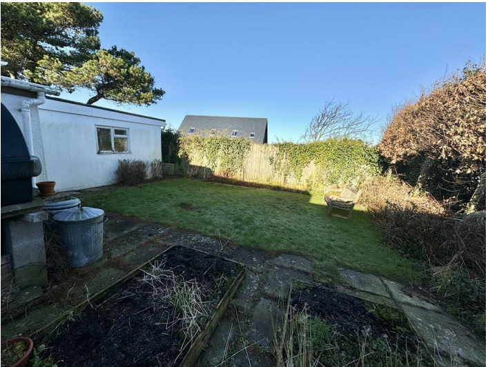
The property has a spacious front tarmacadmed driveway with access to double garage, a wrap around lawned garden with steps and ramp leading up to front entrance door. To the rear, there is a private and enclosed garden as well as a separate rear patio seating area.