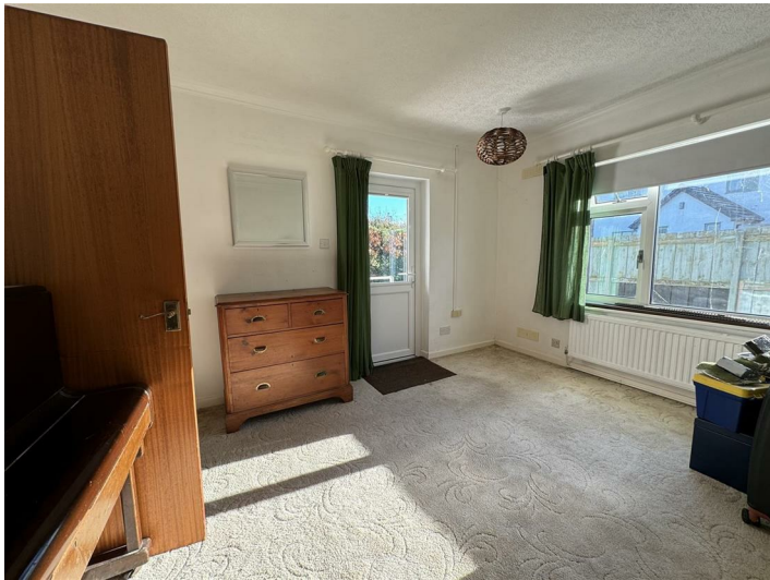
With window to side, radiator and glazed door with external ramp to rear patio.