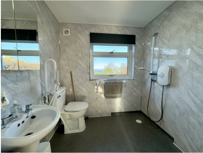
With wc, wash hand basin, mirrors vanity cupboard, electric shower, heated towel rail, panelled surround walls and wet room non slip flooring, window to side with outstanding sea views.