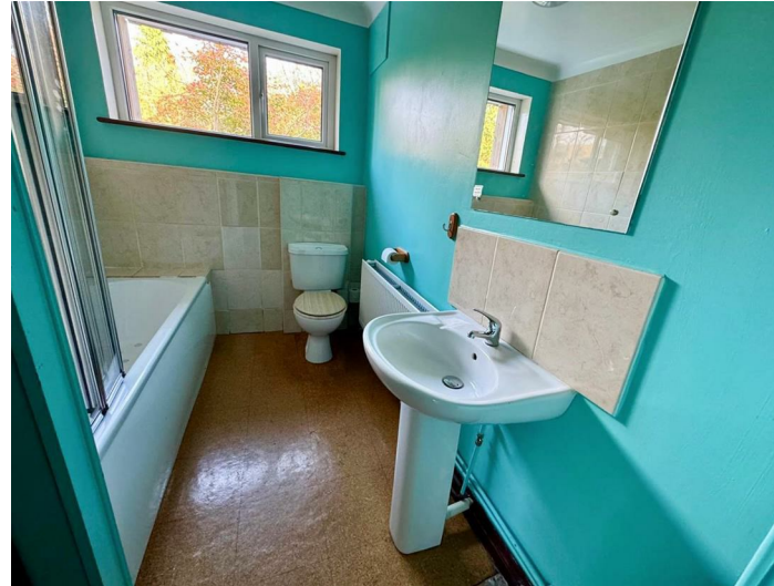
Comprising WC, bath with Creda shower over and screen, washbasin, part tiled walls, radiator, window to fore, shelving.