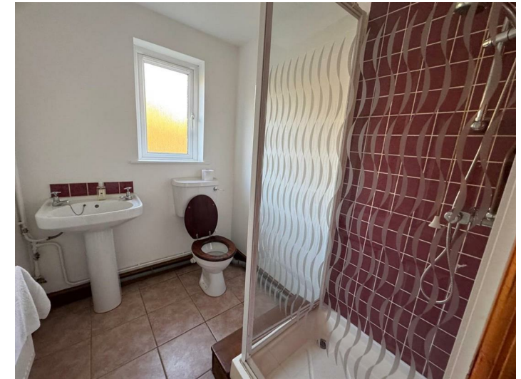
Shower cubicle, WC and washbasin, radiator, tiled floor and obscured window to fore.