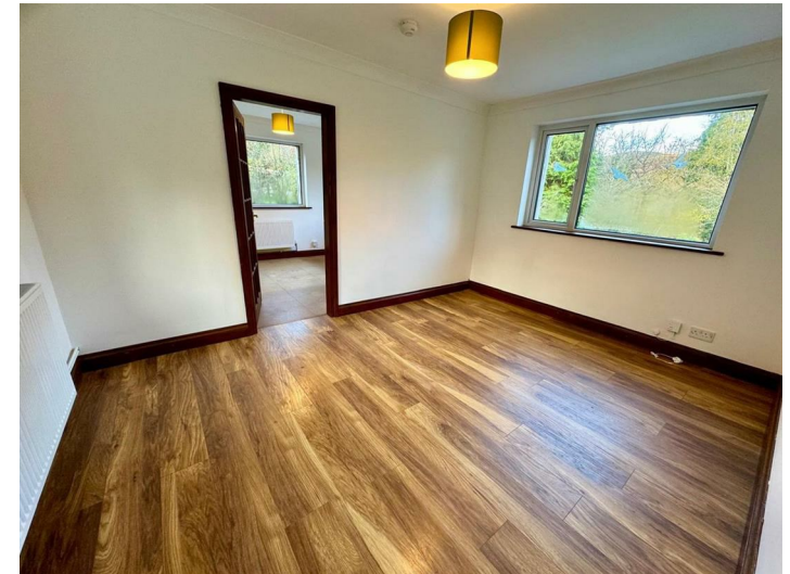
Windows to fore and side. Radiator. Door to