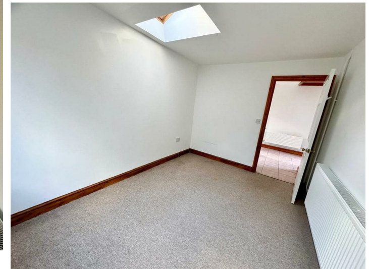
Window to side, Velux window, radiator.