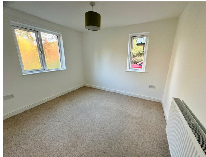
Window to fore and side, radiator.