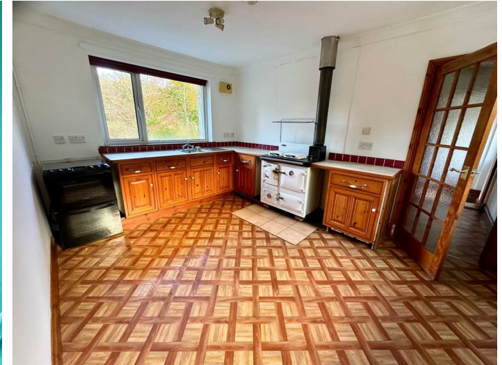
Single drainer sink unit with mixer tap. Solid fuel Rayburn, concealed fridge, extractor fan, radiator. Window to fore and rear.