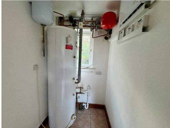
Housing the Ecodon air source heating system. Room for white goods. Window to rear.