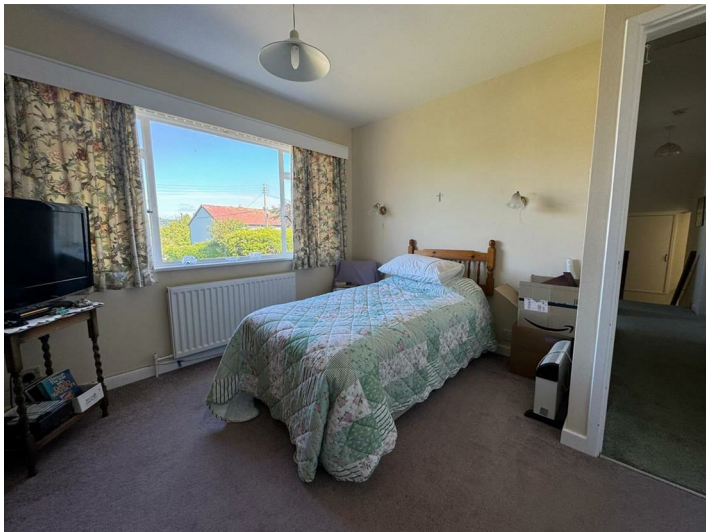
With windows to fore, fitted wardrobe and radiator.