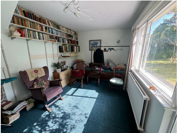
With door and window to rear, radiator.