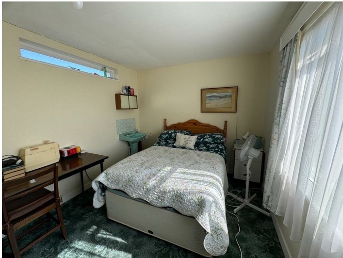
With window to rear, fitted wardrobes, vanity unit and radiator.

Gated access to tarmacadamed vehicular hardstanding with access to garage. Large garden to fore and side predominantly laid to lawn with numerous trees and shrubs. Small rear paved patio. Oil tank. Garden shed.