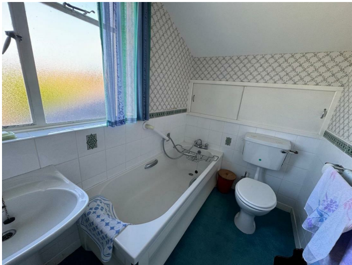
Comprising of bath with mixer tap, WC and wash handbasin. ½ tiled, radiator, cupboard, obscured window to fore. Towel rail.