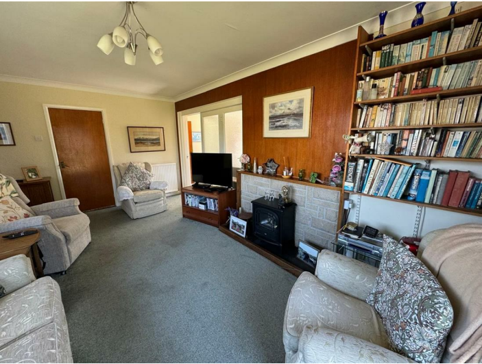
With window to fore, French doors to side, fireplace, radiator and folding door dividing