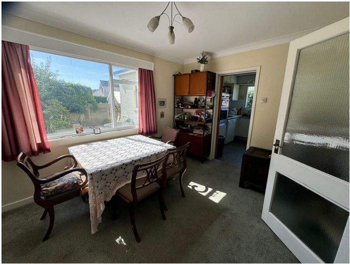
With window to rear, radiator.