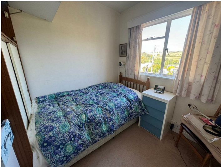
Window to fore and radiator.