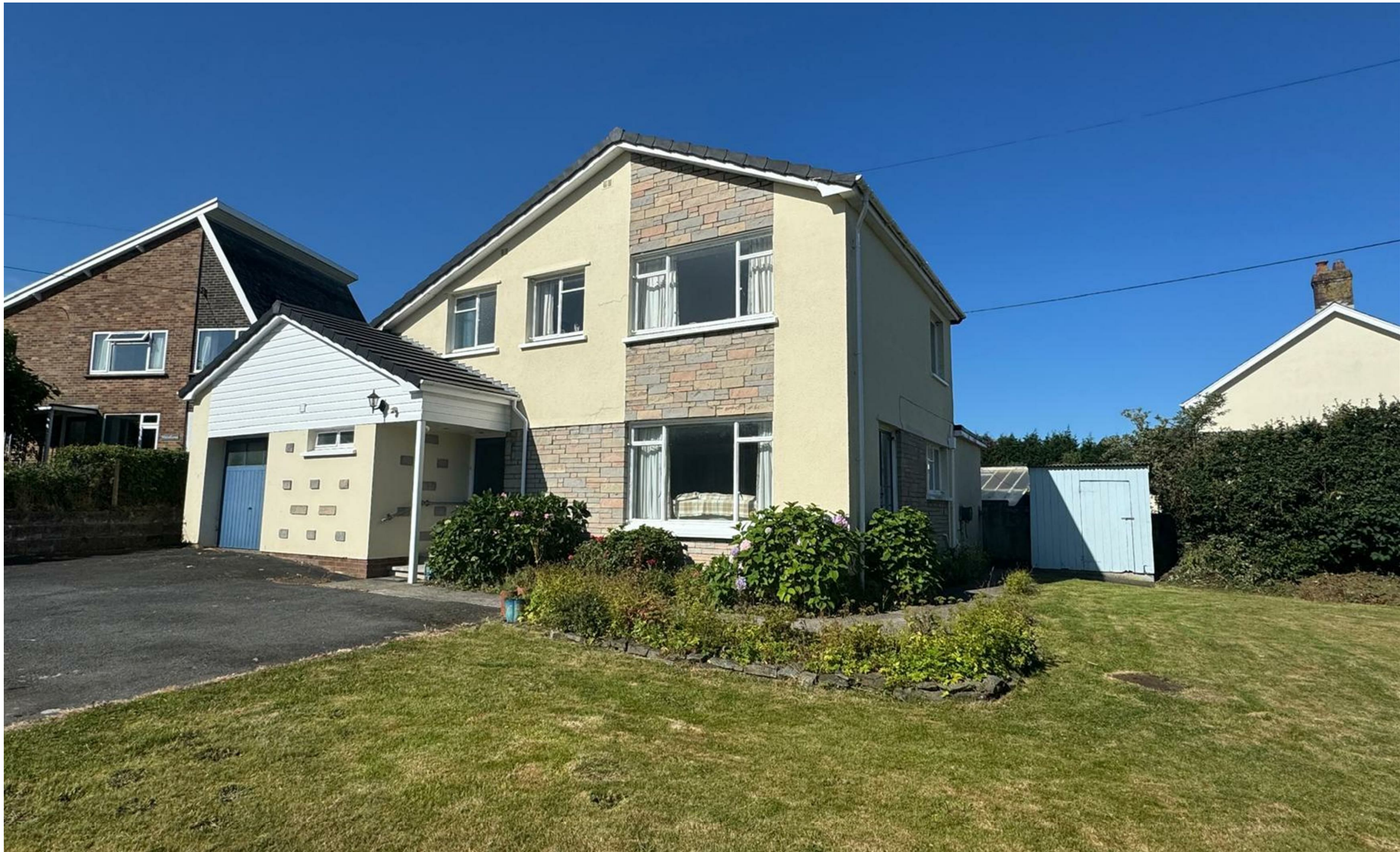
Haere Mai , Rhydyfelin Aberystwyth Ceredigion SY23 4QD Guide price £410,000