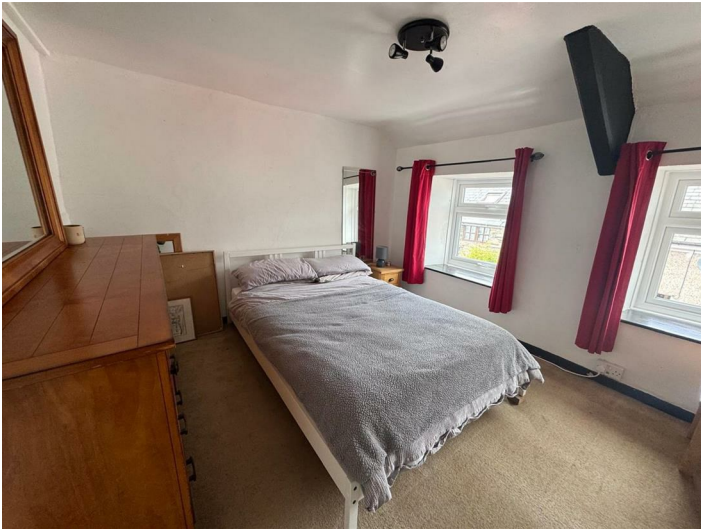
Two windows to fore and radiator.