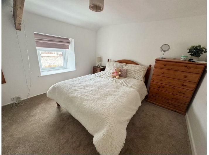
Window to fore and radiator.