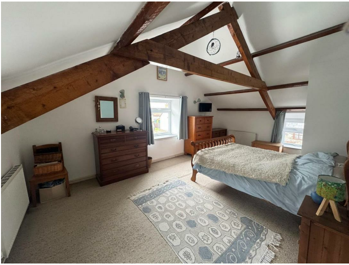
BEDROOM 3 10'2 x 10'8 (3.10m x 3.25m)