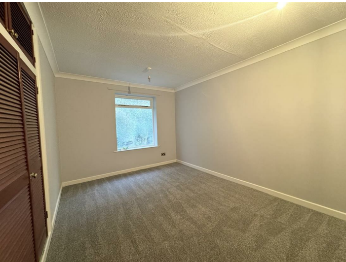
Window to rear and radiator.