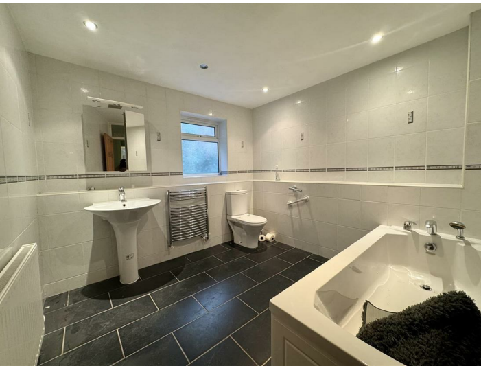
Comprising low level flush WC, wash hand basin, bath, heated