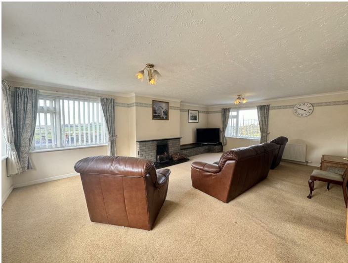
A spacious lounge with large windows to both sides and to the fore, feature fireplace with brick surround and radiators. Outstanding views to appreciate.