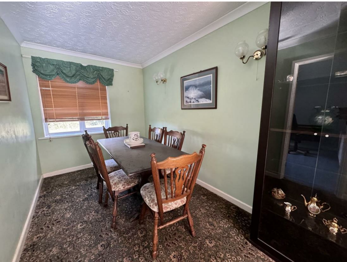
With window to side.