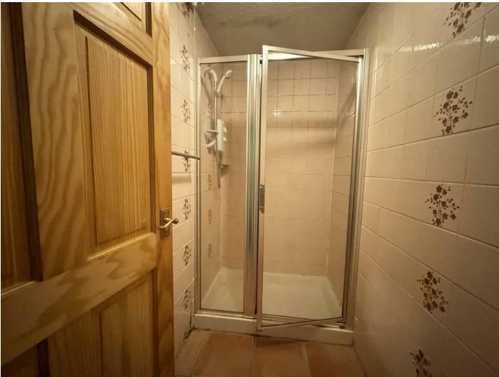
With Triton electric shower cubicle, extractor fan, tiled walls and flooring.