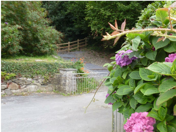
Direct access to dog friendly woodland walking trail.