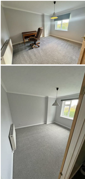
With window to side and radiator. A superb home office/study space.