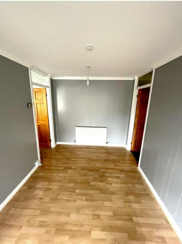
With radiator, laminate wood effect flooring and door through to

Glannant provides for the following accommodation. All room dimensions are approximate. All images have been taken with a wide angle lens digital camera.