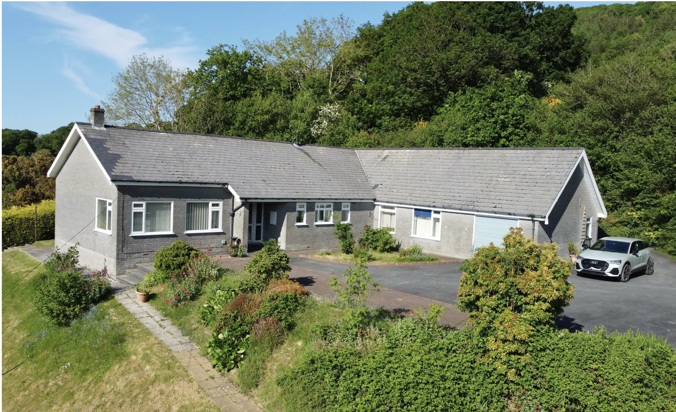
Glannant , Taliesin Machynlleth Powys SY20 8JH Guide price £360,000