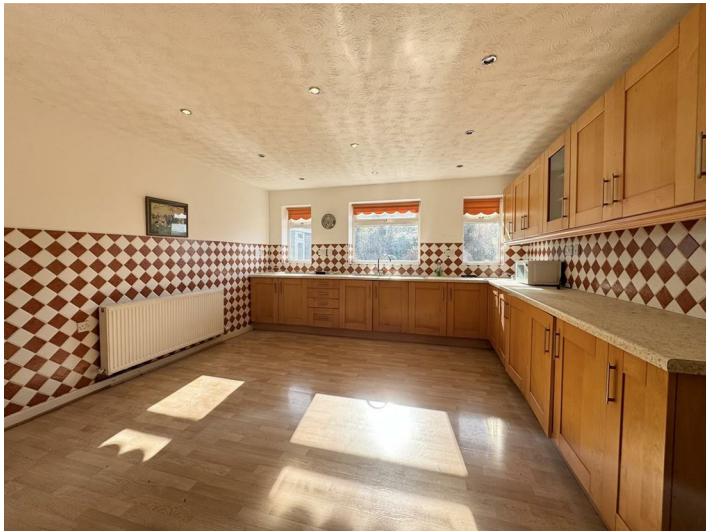
A large kitchen comprising an L shaped fitted kitchen with range of base and eye level units, double stainless steel sink with mixer tap, 3 windows to side, laminate wood effect flooring, tiled splashbacks, radiator and spotlights.