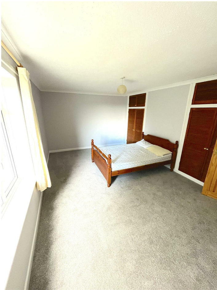
Window to side, radiator and built in wardrobes.