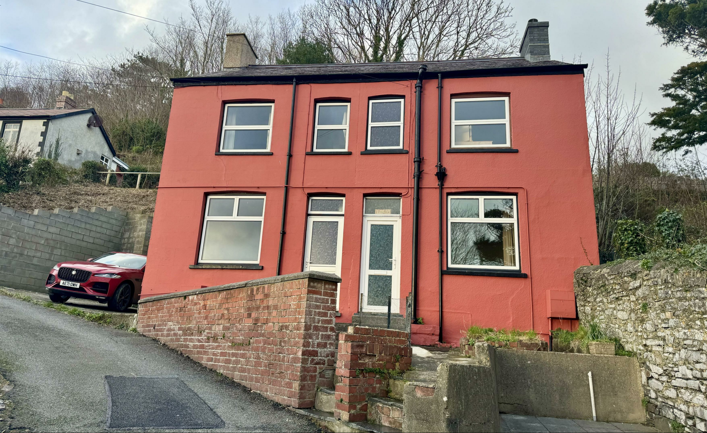
1 Penyfron Penyfron Road, Llanbadarn Fawr Aberystwyth Ceredigion SY23 3QU Guide price £195,000