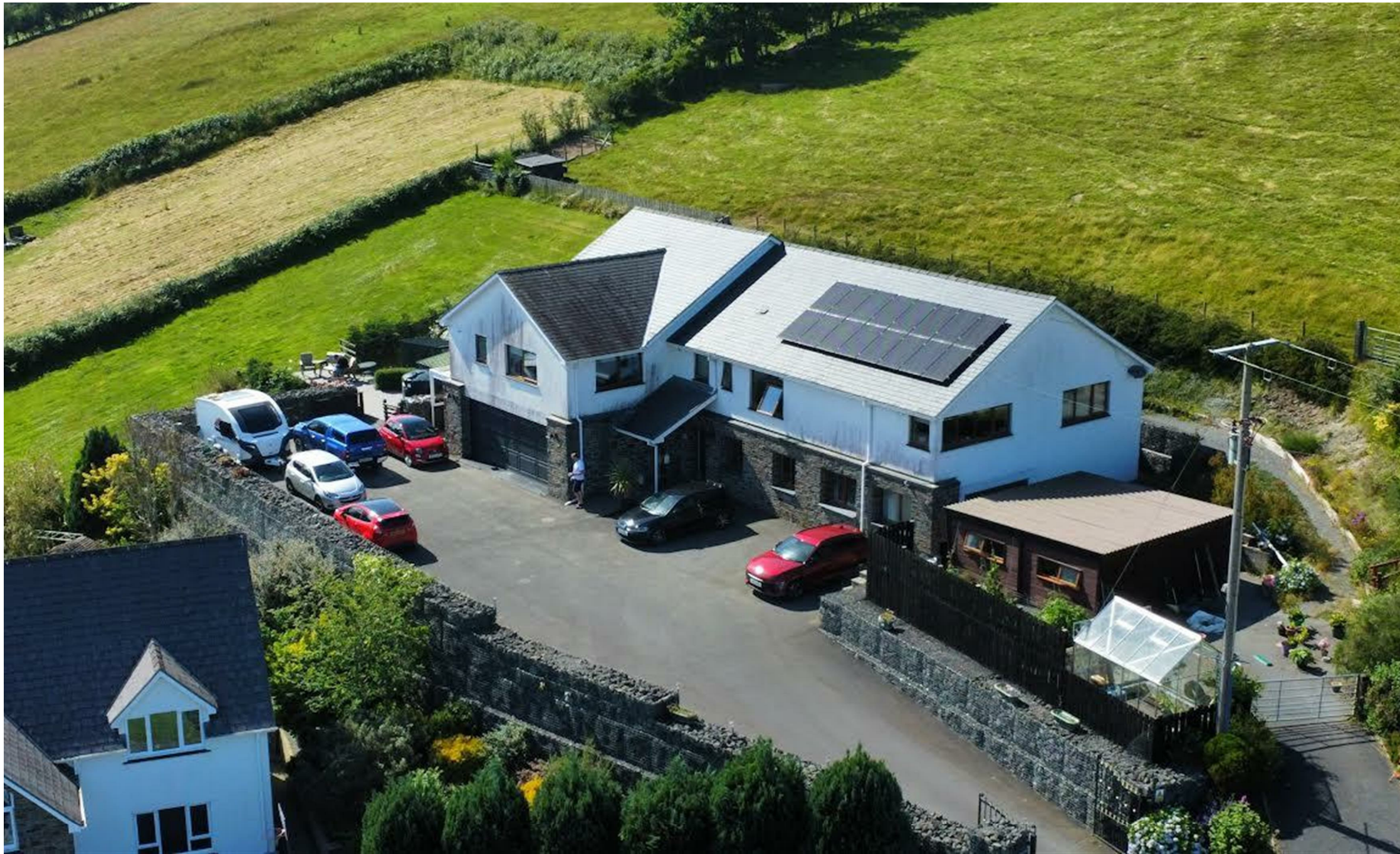
Y Grange , Llanfihangel-Y-Creuddyn Aberystwyth Ceredigion SY23 4LA Guide price £675,000