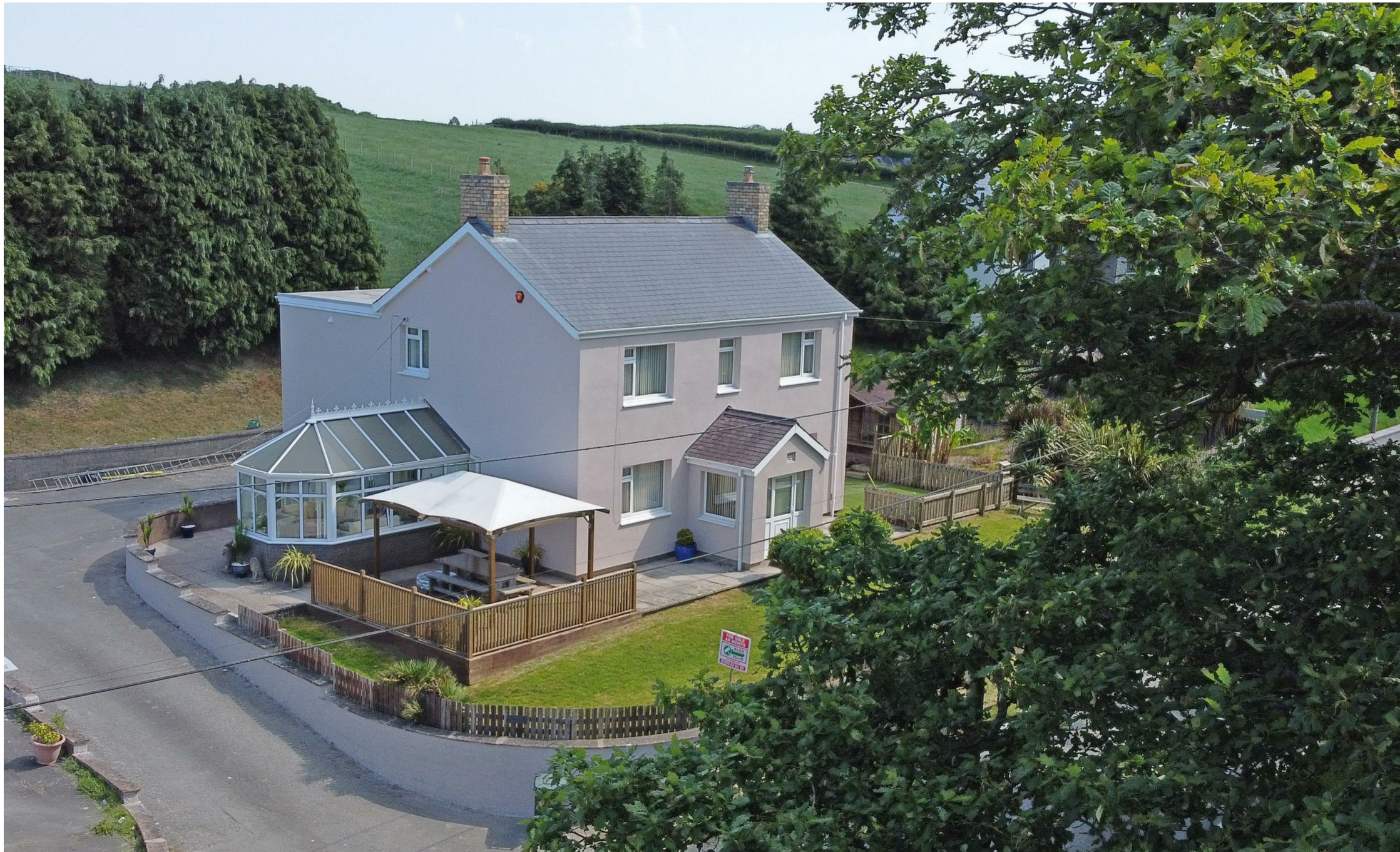
Ty Newydd , Capel Seion Aberystwyth Ceredigion SY23 4ED Guide price £465,000