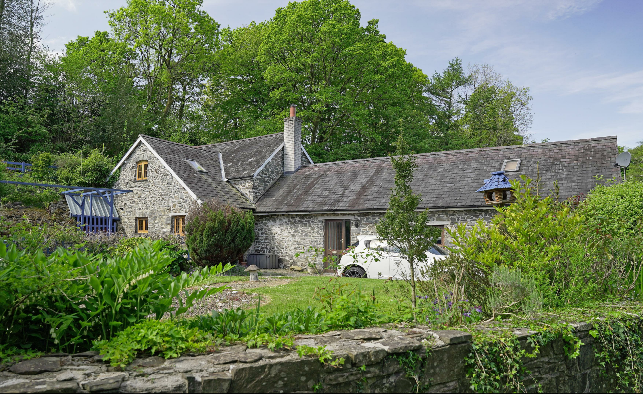
Felin Iago , Llangwryfon Aberystwyth Ceredigion SY23 4HA Guide price £445,000