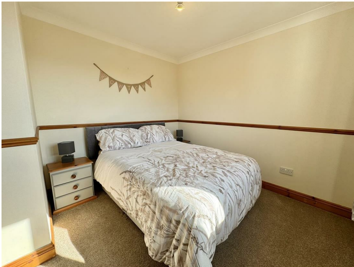
With window to fore & radiator.

13' 4" x 6' 2" (3.96m 1.22m x 1.83m 0.61m )