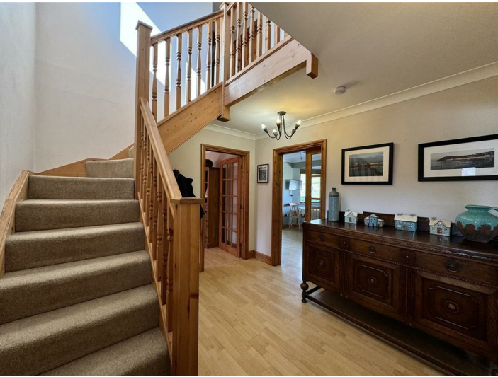
With wooden staircase to first floor accommodation (storage under), laminate wood effect flooring, radiator and doors through to

Glan Y Nant provides for the following accommodation. All room dimensions are approximate. All images have been taken with a wide angle lens digital camera.