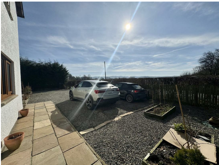
The property is approached via a gated gravelled front driveway with ample vehicle parking and access to garage. A south