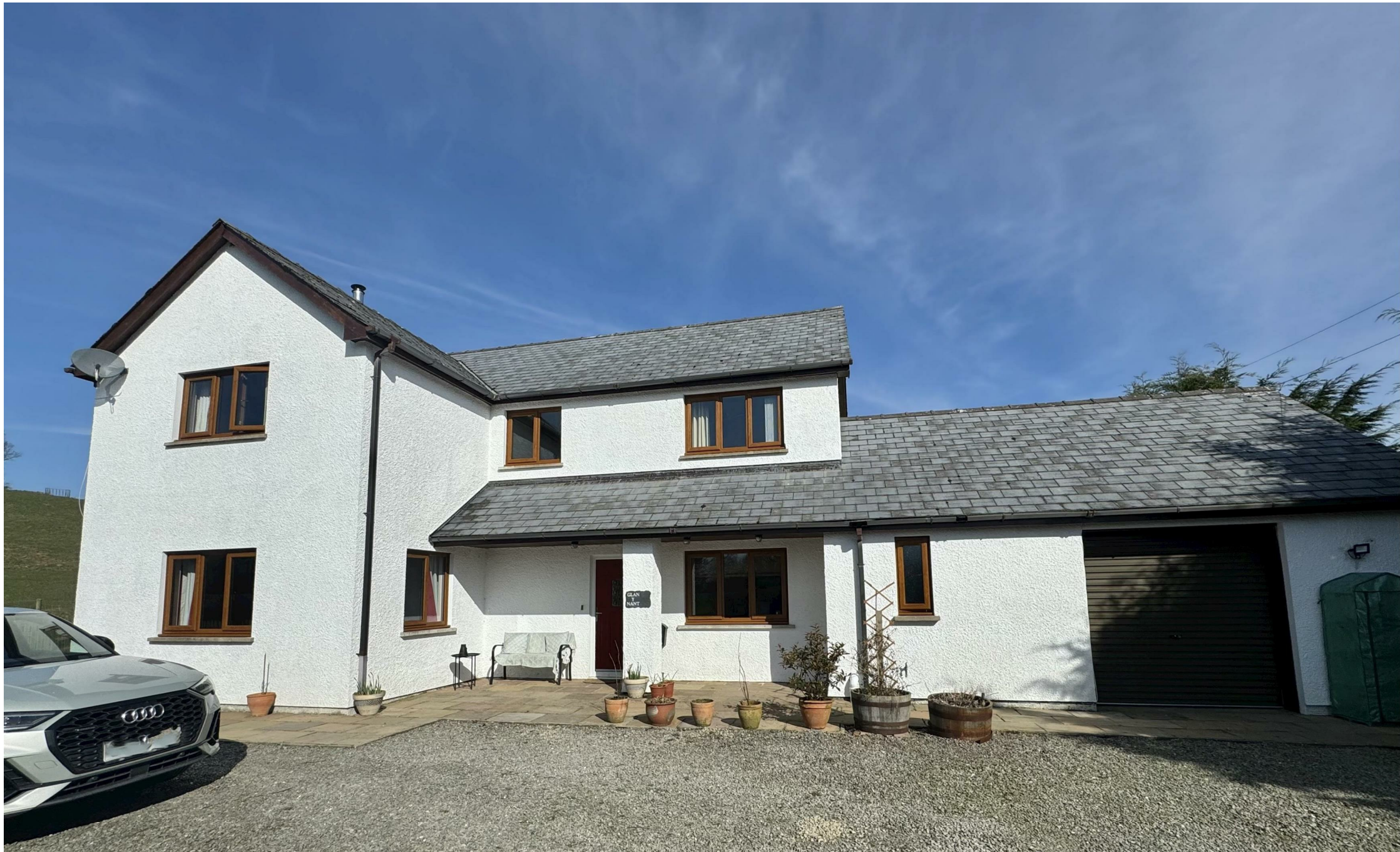
Glan Y Nant , Ystrad Meurig Aberystwyth Ceredigion SY25 6AA Guide price £369,000