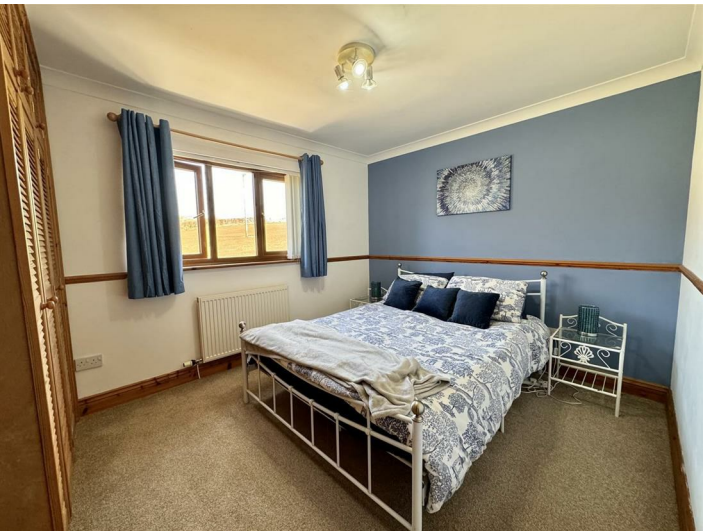
With window to rear & radiator.

10' 8" x 9' 8" (3.05m 2.44m x 2.74m 2.44m )