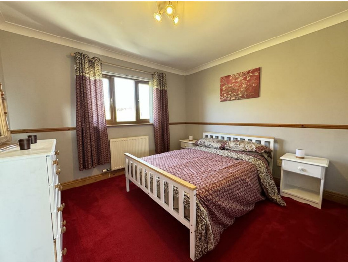
With window to rear & radiator.

12' 9" x 9' 7" (3.66m 2.74m x 2.74m 2.13m )