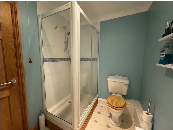
With a double wash hand basin, glazed shower cubicle, radiator, heated towel rail and low level flush w.c.