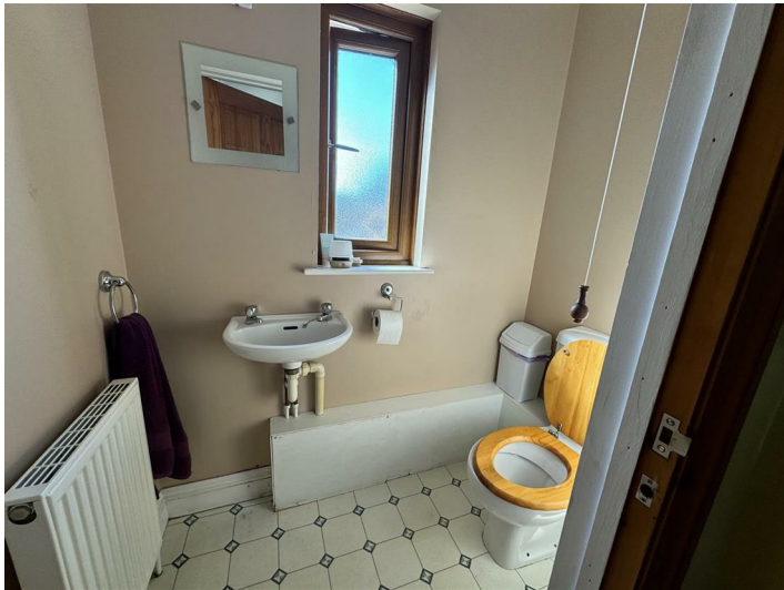
With low level flush wc, wash hand basin and radiator.