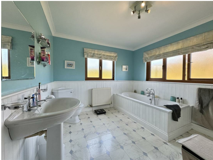
A sizeable family bathroom comprising of a panelled bath , wash hand basin, separate shower cubicle, wc, radiator, windows to rear and side.