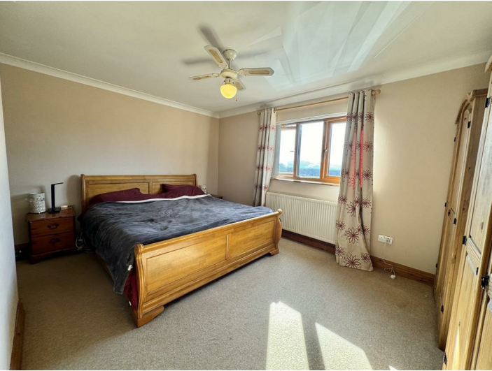
With window to fore boasting lovely views over Cors Caron, separate dressing area, large built-in wardrobe.