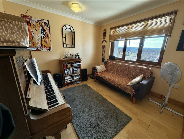
With window to fore, radiator and telephone point.