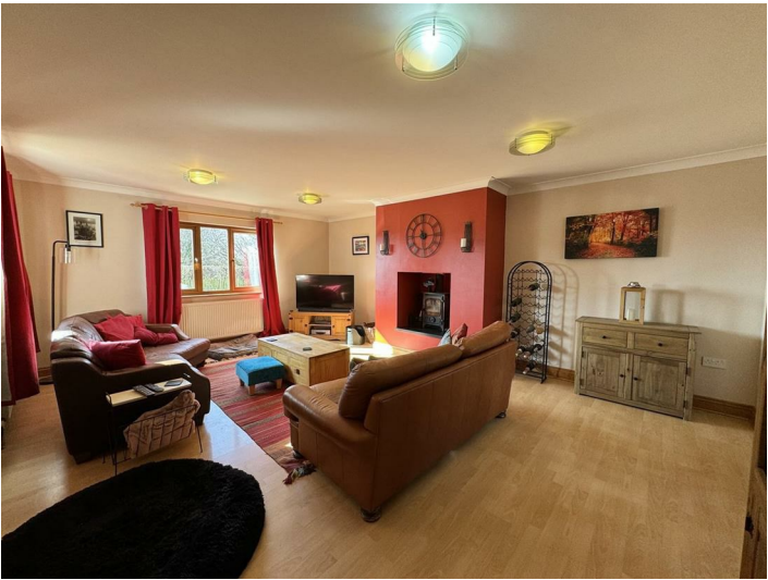
A lovely sized lounge with multi fuel burner, laminate flooring, radiator and windows to fore and side. Opening through to