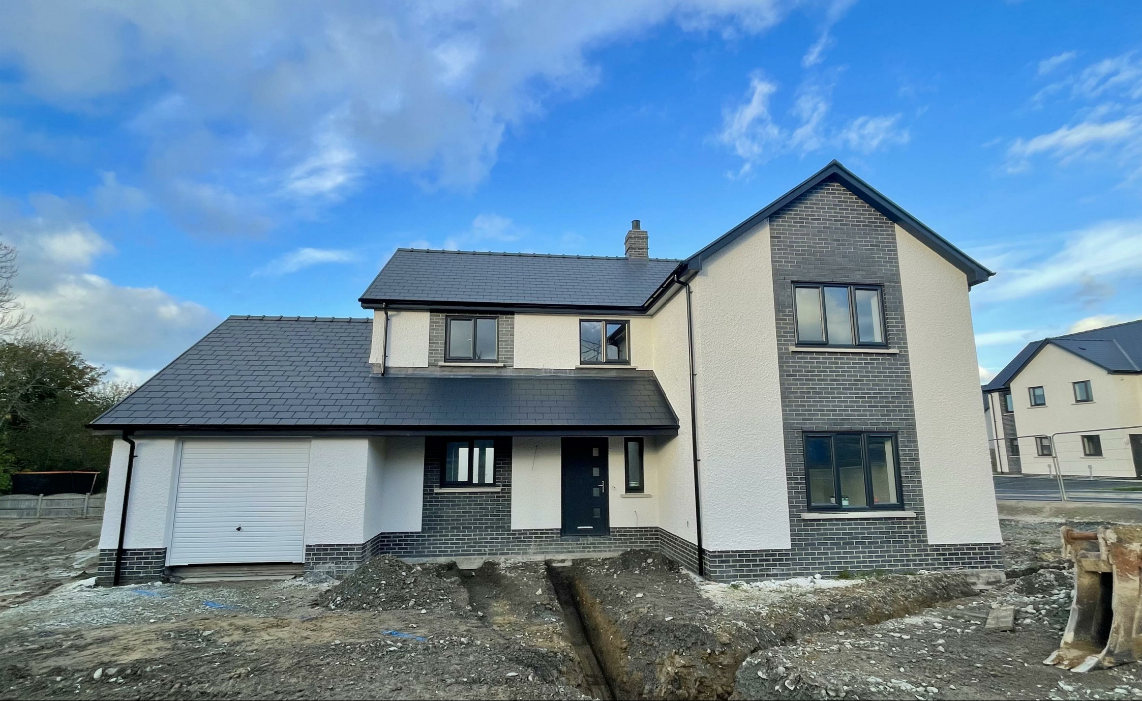
1 Clos Gosen , Rhydyfelin Aberystwyth Ceredigion SY23 4BF Guide price £450,000