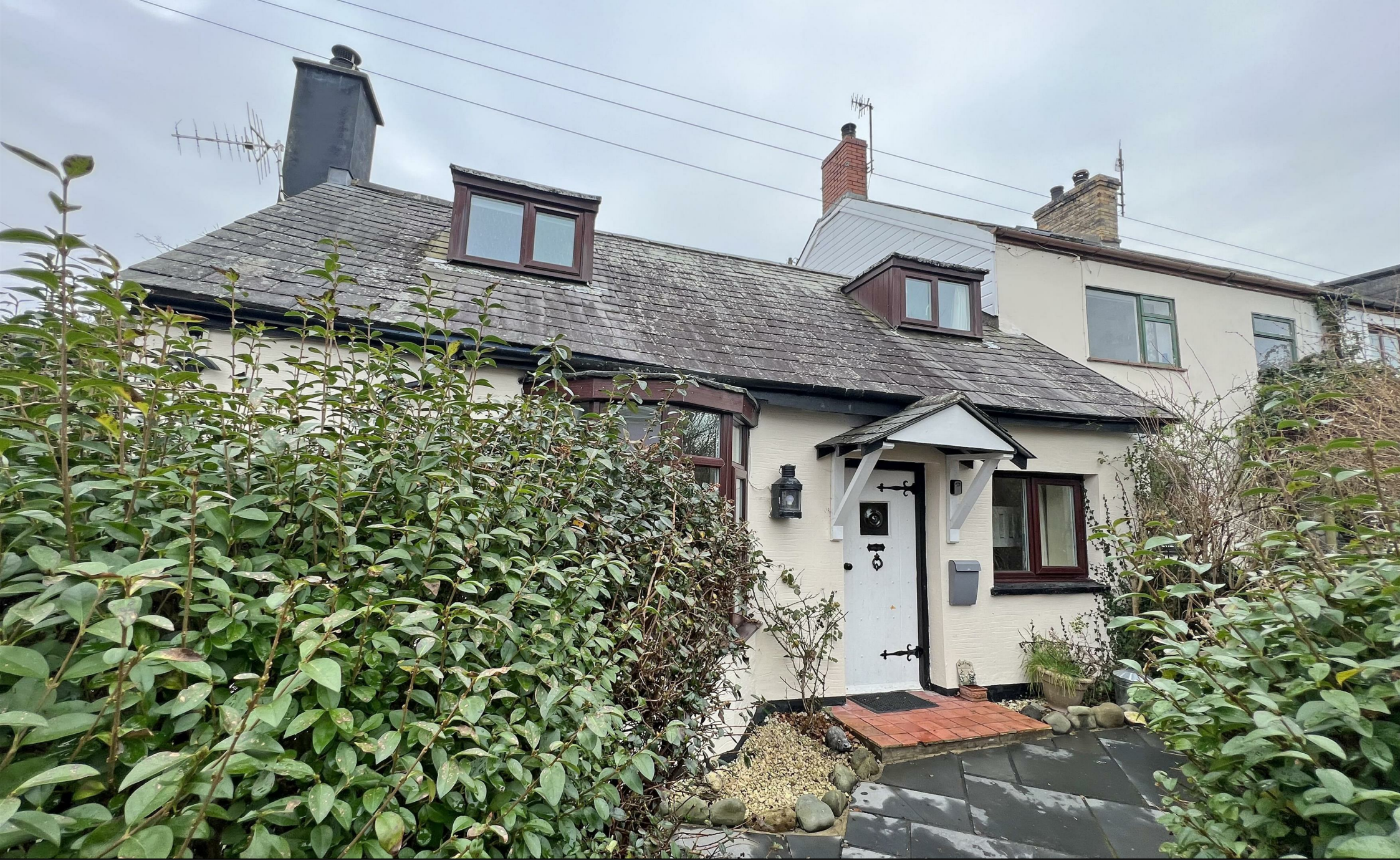
Little Cottage , Glanwern Borth, Aberystwyth Ceredigion SY24 5LT Guide price £197,000