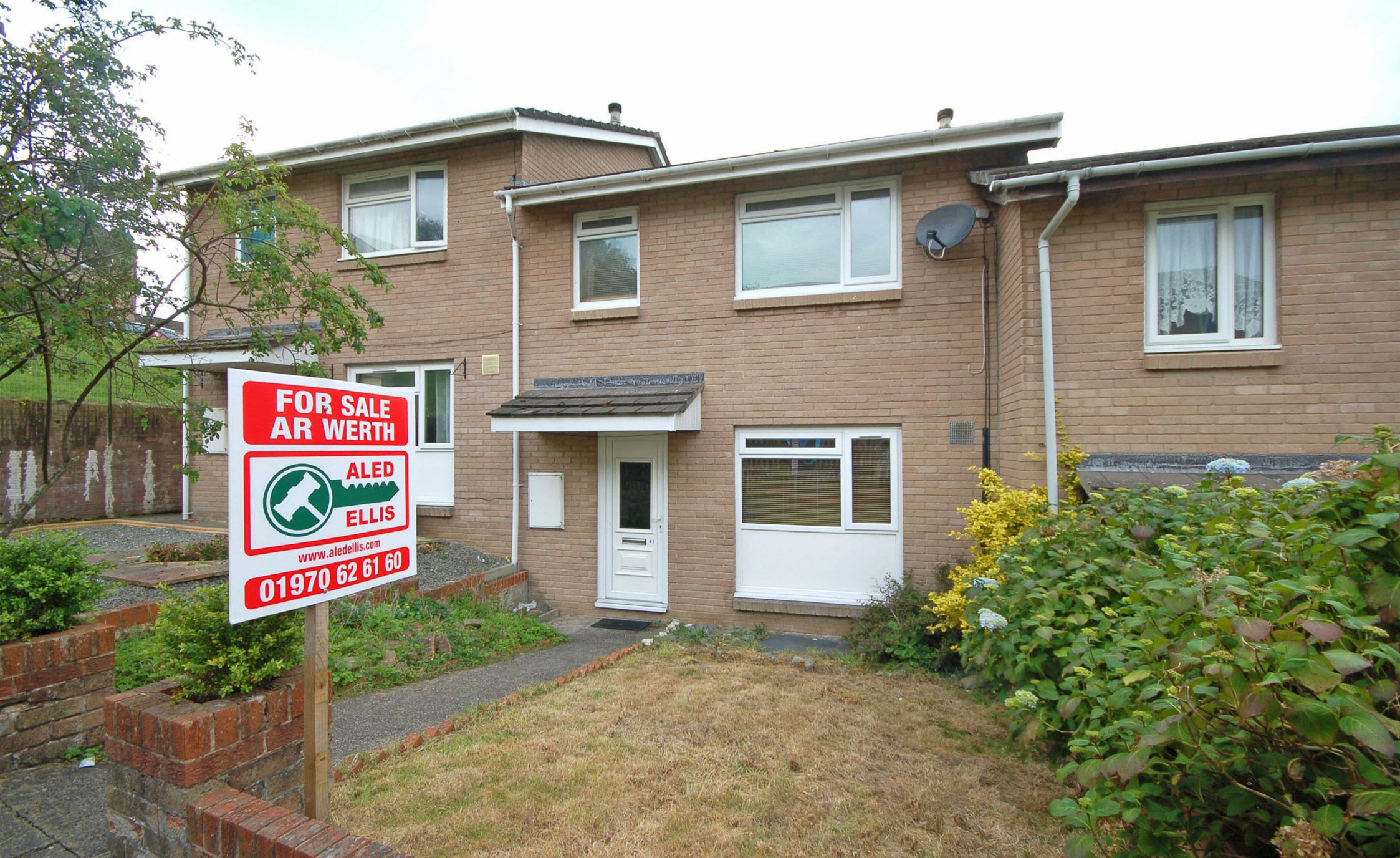
41 Heol Dinas, Penparcau Aberystwyth Ceredigion SY23 3SB Guide price £124,950