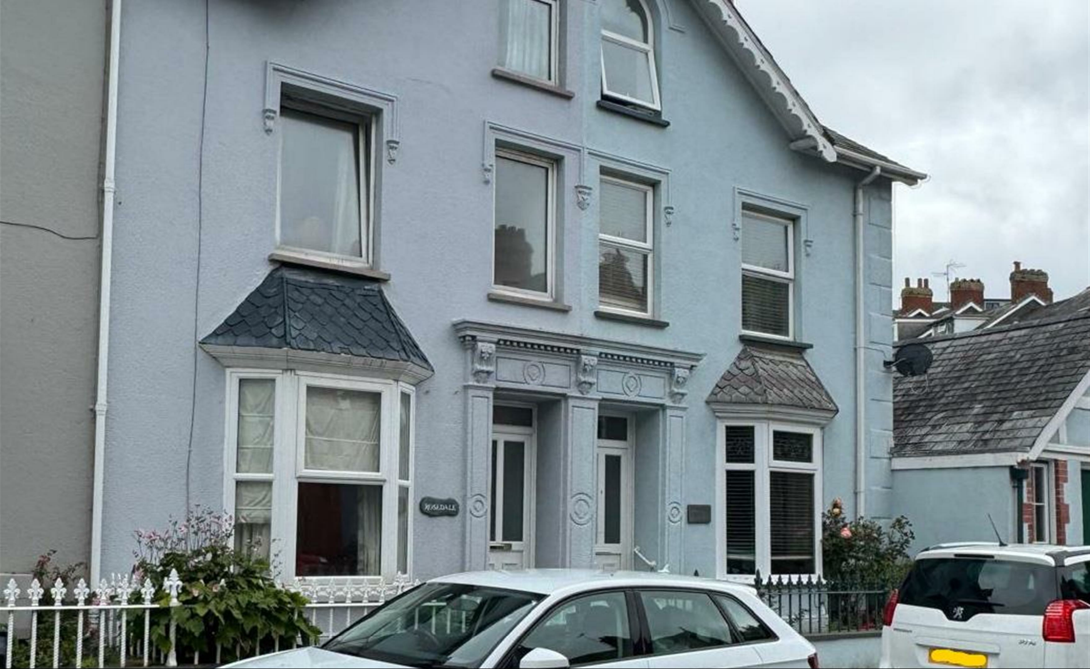
4 Stanley Terrace, Aberystwyth Ceredigion SY23 1LW No onward chain £285,000