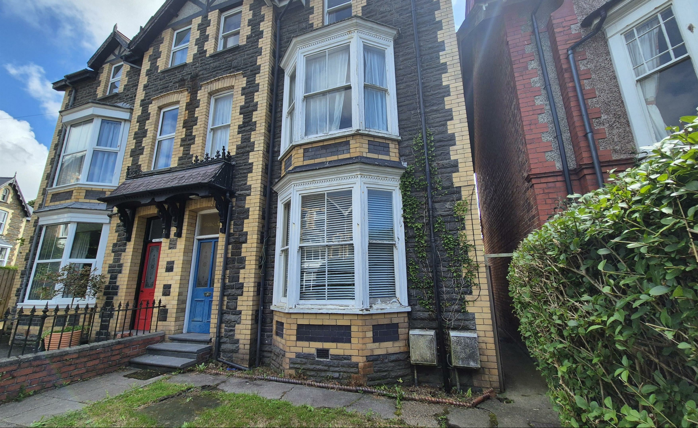
Godre'r Glais Caradog Road, Aberystwyth Ceredigion SY23 2JY Guide price £295,000